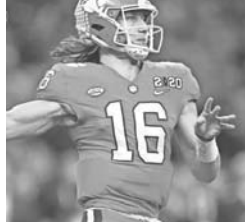
Trevor Lawrence threw for 3,665 yards and 36 TDs for Clemson last season.

2. Texas QB Sam Ehlinger: This spot depends on a Texas rebound, which seems possible but far from certain given the program's recent history. If so, however, the combination of Ehlinger's personality, back story and the Longhorns' national draw would make him a